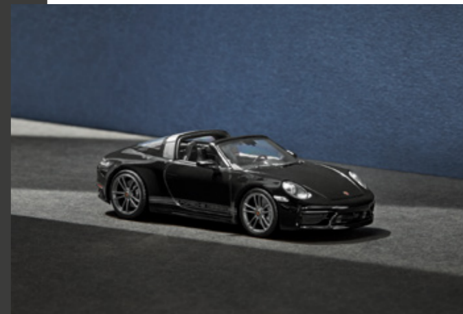
911 EDITION 50 JAHRE PORSCHE DESIGN In black. Interior in black. Made of metal. Scale: 1:43. WAP0201450NTRG