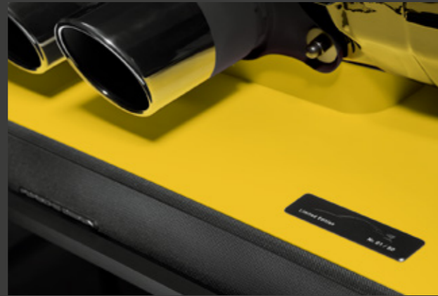
WAP0501130NSBF [Racing Yellow]