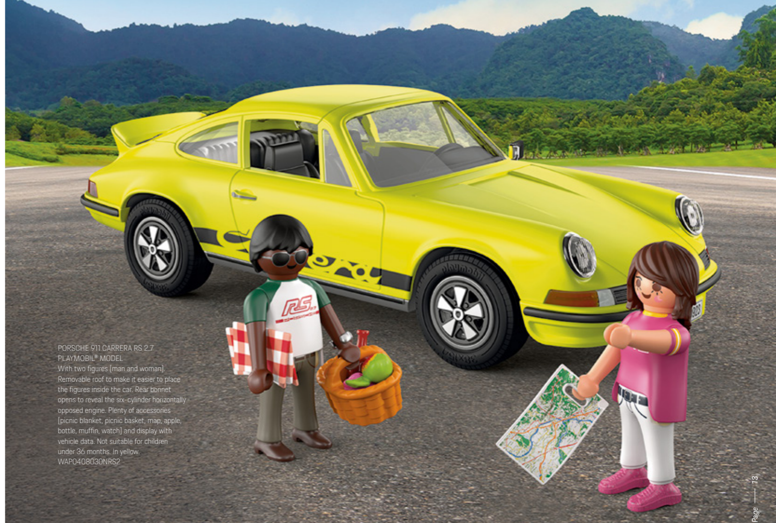
PORSCHE 911 CARRERA RS 2.7 PLAYMOBIL® MODEL With two figures [man and woman]. Removable roof to make it easier to place the figures inside the car. Rear bonnet opens to reveal the six-cylinder horizontally opposed engine. Plenty of accessories [picnic blanket, picnic basket, map, apple, bottle, muffin, watch] and display with vehicle data. Not suitable for children under 36 months. In yellow. WAP0408030NRS2