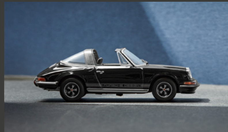
911 TARGA S 2.4 [1972] In black. Interior in black. Made of metal. Scale: 1:43. WAP0201980NTRG

The fact that top performance is also available on a small scale can be seen in the two new 50Y PD model cars which, created for the 50th anniversary of Porsche Design, will enable you to take a piece of that sports car feeling off-road, indoors with you. Because the Porsche 911 S 2.4 Targa from 1972 pays homage to the roots of the Porsche brand. And the timeless reinterpretation, the 911 Edition 50 Years Porsche Design, takes us along the racing line from the past towards the future.