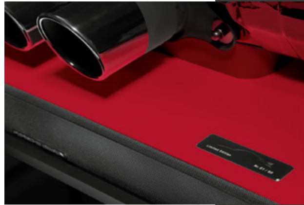
WAP0501110NSBF [Carmine Red]

Sports car enthusiasts can also enjoy the sound of a super sports car at home – with the beloved high-end sound system: the 911 Soundbar. Made from the original exhaust system of the 911 GT3, the high-end 2.1 virtual surround system uses the rear silencer and the tailpipe trim of the 911 GT3 as a resonator. And in so doing reverses the original function of the genuine parts. The result? Brilliant sound quality and a design with the power of pure sports car passion. It's not just the rich tones that are sure to catch the attention of soundbar fans – because the new 911 Soundbar Final Edition is also available in three new colours.