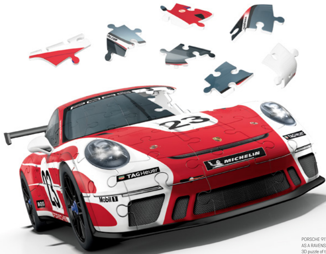
PORSCHE 911 GT3 CUP SALZBURG DESIGN AS A RAVENSBURGER 3D PUZZLE 3D puzzle of the 911 GT3 Cup Salzburg Design in the famous Salzburg livery with start number 23. Puzzle consists of 108 individually shaped pieces, with EasyClick technology. With illustrated instructions and movable wheels. For all racing drivers between 10 and 99. In red/white. WAP0400040MPCS